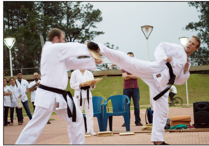
BreakThrough performing a demo in the park

process the team broke over 230 boards and 200 roof tiles with their hands, feet, elbows, and heads. Not only did this ministry reach the hearts of many who had never heard the gospel, but it opened several doors and created new contacts for Grace Bible Church.