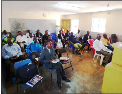
Bible Teachers' Training in Malawi

● In Malawi , current and future Bible teachers from Tanzania, Zambia, Zimbabwe, and Malawi gathered for two weeks of training in the area of systematic theology in May. During the conference students were given information and literature which they took back to their home countries to teach leaders and prospective leaders in their own churches. The next conference will take place in Zambia in July. These two conferences in 2019 are part of a three-year, six-part series of training sessions organized by GMI missionary Bill Vinton for Bible teachers in Africa.