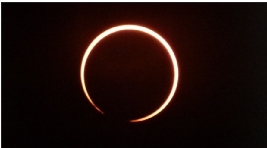
The annular eclipse