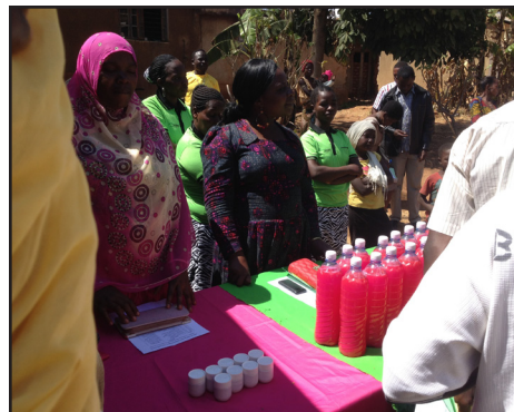
Selling liquid soap made after being trained at GCDE