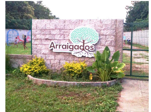
Entrance to the ministry center property in Nicaragua