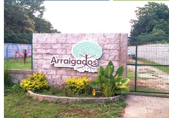
Entrance to the ministry center property in Nicaragua