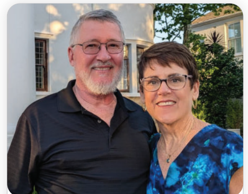
No longer babes...