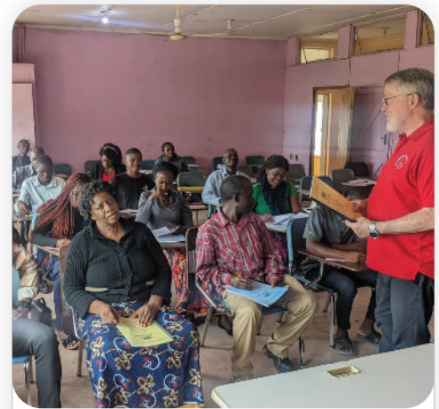
The Grace Church in Kabwe hosted this Bible school module. Students came from several churches.