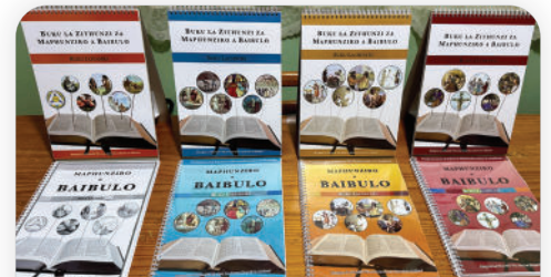
Sue rejoiced to see the 106 chronological Bible lessons finally printed!