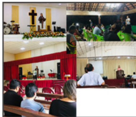
Talo preaching at our GMI affiliated Grace Churches in Bolivia