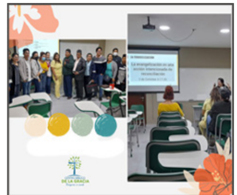
Evangelistic workshop at CBG