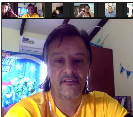
The Book Club