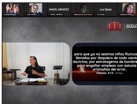
Talo preaching at Emanuel Church