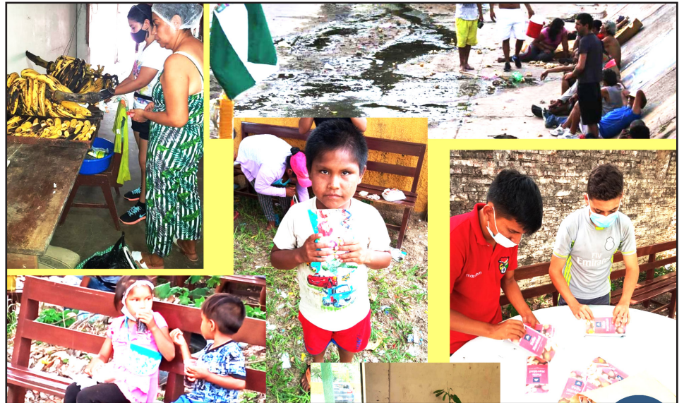
DAR Christmas Project 2020