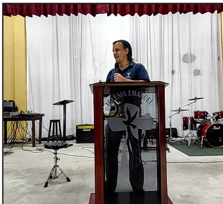
Talo preaching in Emanuel Church