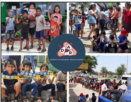
DAR Christmas project 2021