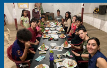
Gingerbread House Making with the Youth Group