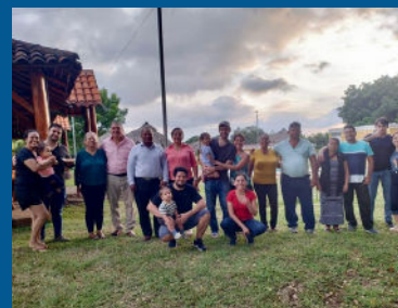
Marriage Retreat Group