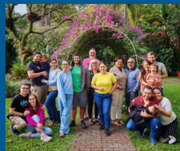
GMI Central America Gathering