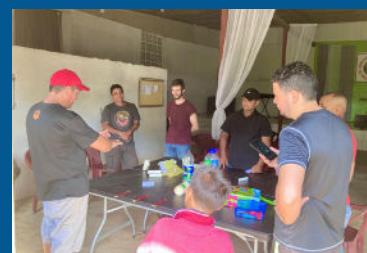
Monthly Men's Meeting