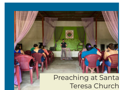
Preaching at Santa Teresa Church

Thanksgiving provided us with a unique opportunity to share the truth of God’s Word. Even though Thanksgiving as an official holiday doesn’t exist here, everyone here is familiar with it and has an opinion about it. We invited people from our block to a “Friendsgiving” as an opportunity to give thanks to God and experience the way gratitude affects our lives (“Praise the Lord, my soul, and forget not all his benefits” Ps. 103.2). Gathering with people from the community was also helpful in envisioning what a church here in Dolores may look like if that is the direction in which the Lord leads.