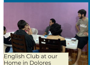
English Club at our Home in Dolores