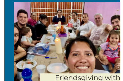
Friends giving with Neighbors