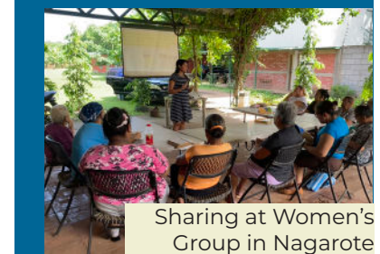
Sharing at Women’s Group in Nagarote