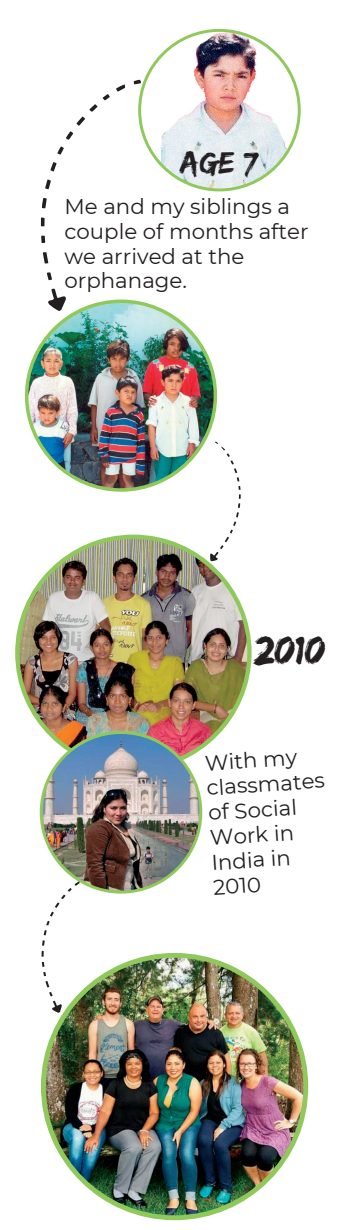
2017 Students & instructors when I studied in Costa Rica in 2017.