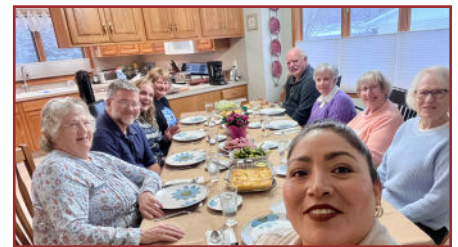
Having lunch with dear friends from Rush Creek Bible Church