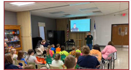
Sharing at Anchor Point Bible Church

One especially meaningful gift from the Lord during this season was being reunited with my siblings during Easter. My brother came from Mexico, my sister welcomed us in Iowa, and for the first time in many years, the three of us were together again. After years apart, it felt incredibly special and deeply personal—a reminder of God's kindness even in the middle of ministry travel.