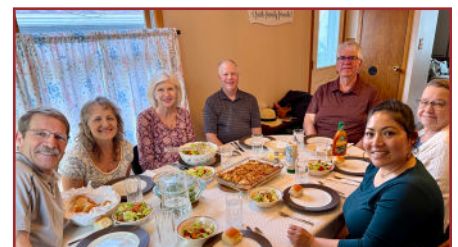
Enjoying a meal with friends from Bethesda Church