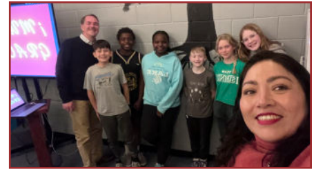
Sharing with the teens at Grace Bible Fellowship