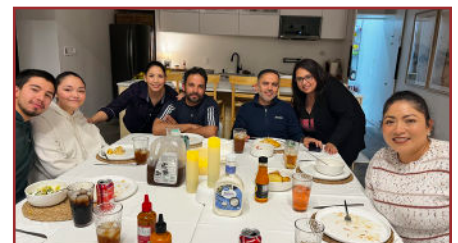
Celebrating Easter with my family in Iowa