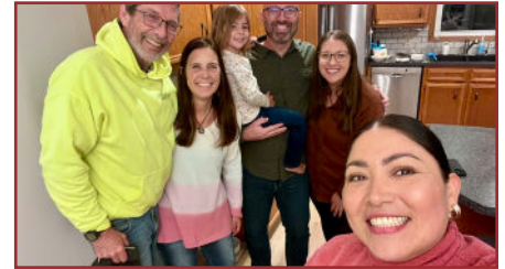
With the Bunch and Miller families in Michigan