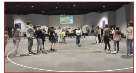
Youth group at Celebration Bible Church