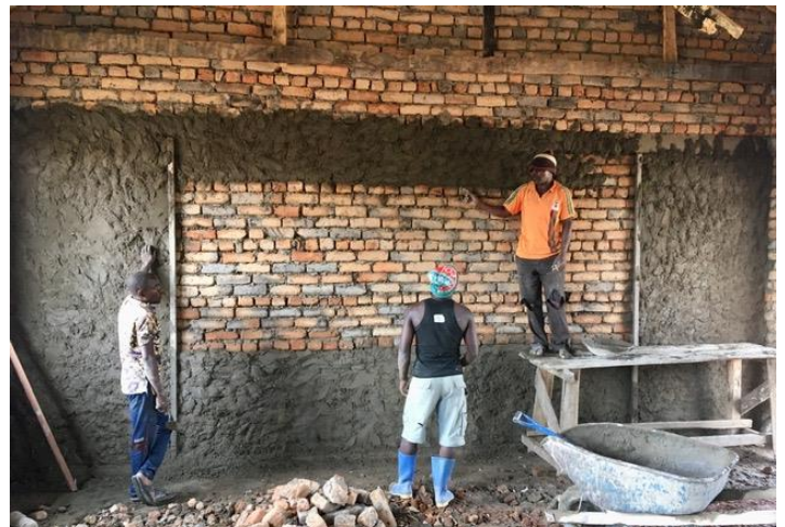
Plastering the walls in the classroom. The unplastered center of the wall will be where we mount the black board.