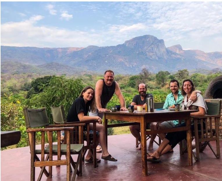
Guests from Arusha on their way to Lake Tanganyika. We have more and more people driving down the road into the valley to see what we are doing here! Maybe you'll come visit us sometime?