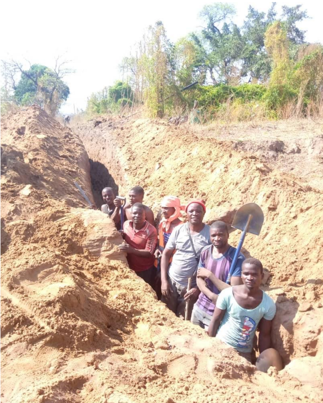
Digging the trench for running the pipes for the Lyanza water project. These guys are pros!