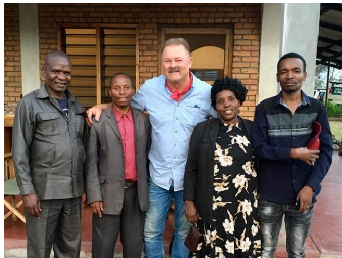
Visit by several Grace church leaders to our Nsanga training center.