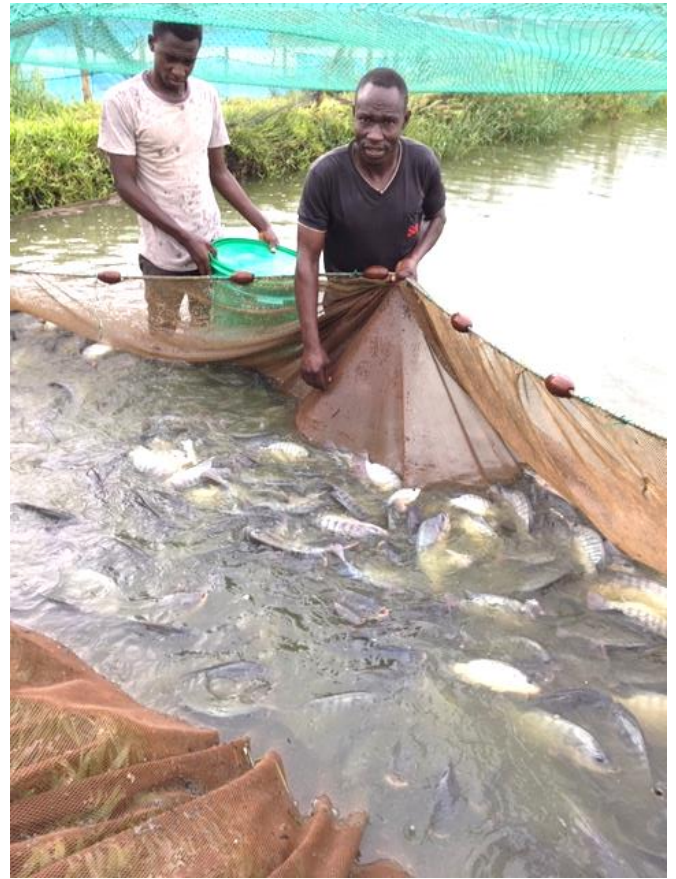
Visiting Ruvu Fish Farm in Mlandizi, Tanzania where we got our Tilapia fry for our fishpond two months ago. The manager there was able to give us a tour and answer our questions. The fish you see pictured here are what our fish will look like at 7 months.