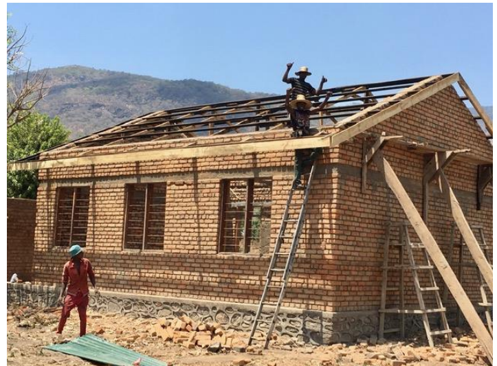
Before the roof went on.

Nsanga village classroom coming to completion. The village wants to open the school this January for first grade students to begin studying in the classroom we built. The rest of the school is under construction by the village and they project that they will have another classroom done by next year. They have three more classrooms built to lintel/door height.