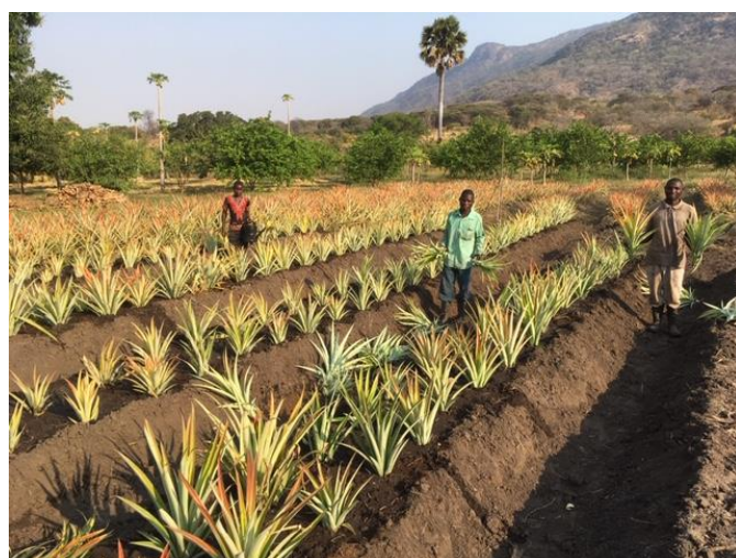
Planting pineapples in our Nsanga AG center