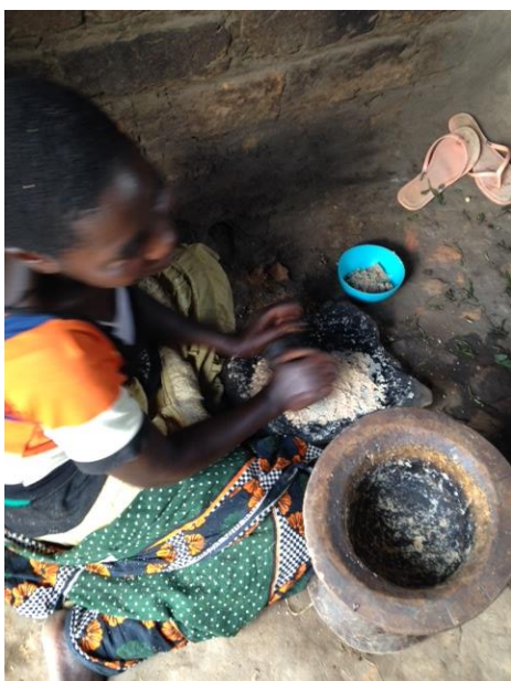
The Nsanga village chairman's daughter hand grinds peanuts to mix with cooked greens.