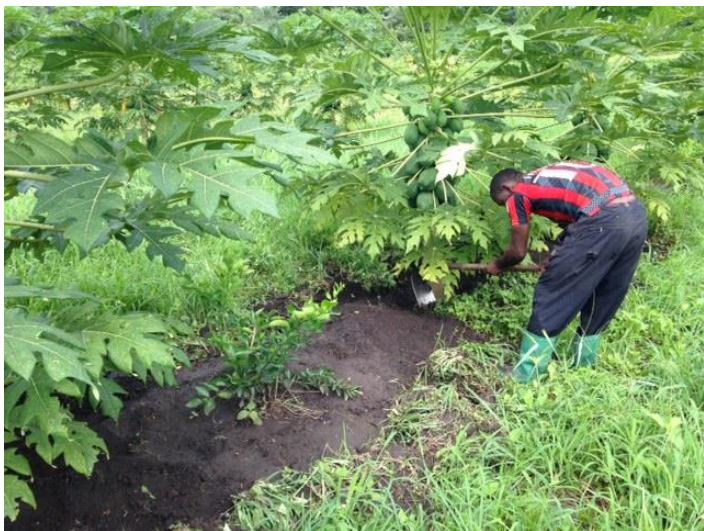
Frenki Fungamali weeds between papaya and hybrid lime trees. The rainy season is a busy time for any agricultural work as weeds grow quickly!