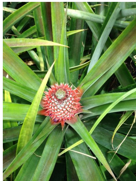
A pineapple inflorescence. It takes 12-18 months to grow a pineapple. The plant produces suckers as the fruit matures, which is the primary way of propagation.