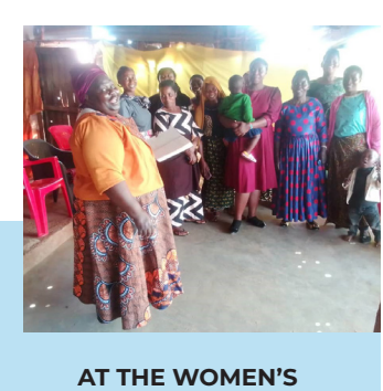
AT THE WOMEN'S CONFERENCE IN CHUNYA VILLAGE