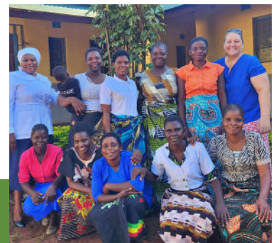
Grace Church of Malawi Women's Department leadership