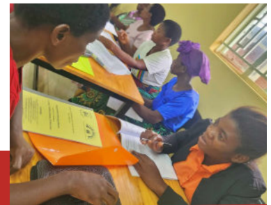
Pastors' wives practicing sharing the Gospel