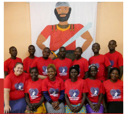
Youth Conference Staff