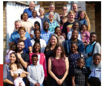
GMI Malawi Team with our Guest Speakers.