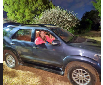
My new Toyota Fortuner!

As we work with the Grace Church in Malawi's leadership, we participate in many meetings where we provide advice and help them learn to more effectively oversee the nearly forty churches and more than twenty church plants throughout the country. Decisions made at these meetings include determining which men are ready to lead a church, how to help church plants buy land for building churches