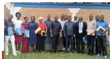
One of the BGBI Bujumbura classes after a module held this fall