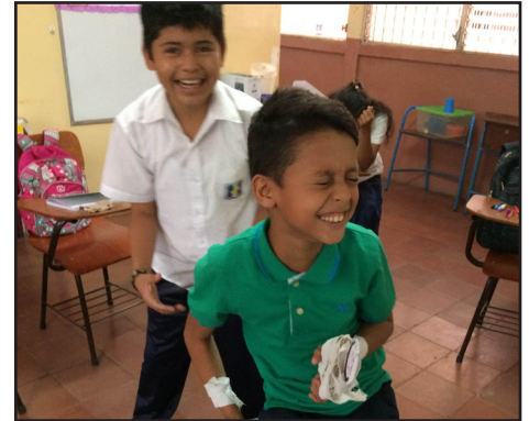
Deaf Kids Good Samaritan