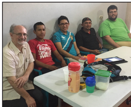
Bible study group