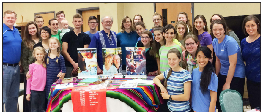
In the Gap Team