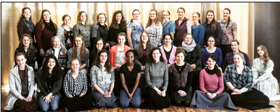
Single young ladies retreat