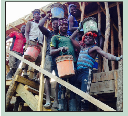
Most things are still done by hand where we live. It is effective and allows us to hire local men who love the salary they make while helping us. It is also one of the best ways to make relationships! These guys helped mix concrete and haul it by the bucket to build our home.