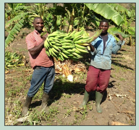
Plantain bananas are called Matoke in Swahili. We have imported several varieties like these grown at our valley AG center.