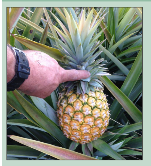
Pineapples growing at our Nsanga AG center.