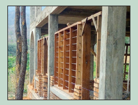
Masonry work going on as we fill in between the poured concrete columns. It is our hope to move into this home before Christmas.