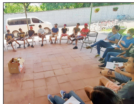
Kids' Games Training

I was in charge of the children's registration part, badges for every kid and the welcome program for the whole week. On the last day