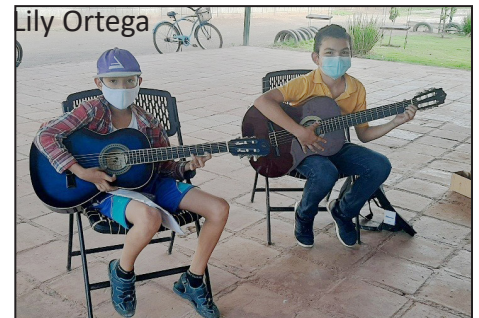
Using the new guitars