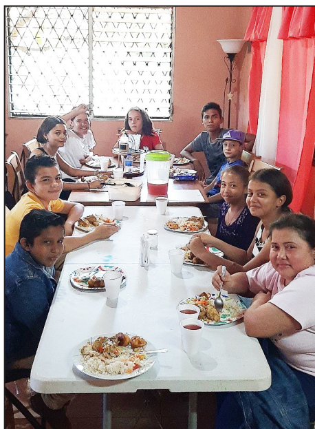
Lunch with students from guitar class

In August, we are so happy that we are sending three people to Costa Rica for three months to be trained about missions and fully know about Jesus' ministry here on earth. We trust God He will use their lives in Arraigados to fulfill His will in Nicaragua.