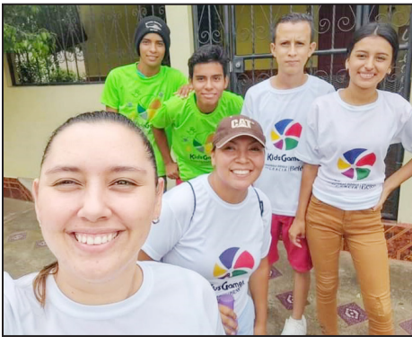
Kids' Games Training 2

I did the cultural connection, where I present my country Bolivia to the kids. That was fun!