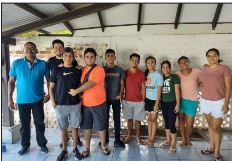
Leadership in Arraigados

During the next six months, I'm planning to start a new students group for the guitar classes. The course lasts four months or so. It is good that people here spread information about the classes by word of mouth. Usually I have 4 or 5 students per class. Lack of guitars will no longer be a problem. We are very blessed with the new guitars we have purchased. They are the Christmas gifts from last year. I'm so thankful for your support in this way!