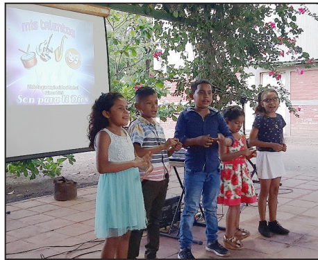
Kids singing during Sunday service