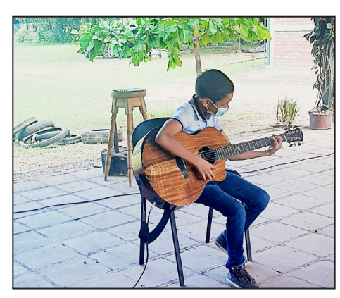
A guitar student

Do not fear, for I have redeemed you; I have summoned you by name; you are mine. When you pass through the Waters, I will be with you: and when you pass through the rivers, they will not sweep over you. When you walk through the fire, you will not be burned; the flames will not set you ablaze. For I am the Lord your God... Isaiah 43.1-3.