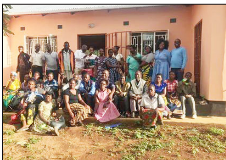
Married Couples Meeting - attended by couples from Lilongwe and surrounding villages