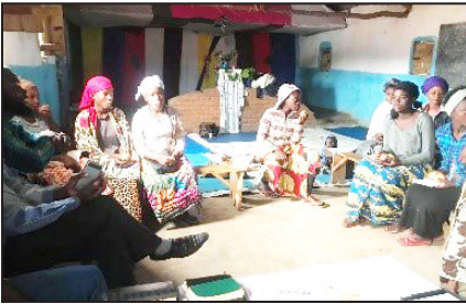
Bible study at Dzaleka