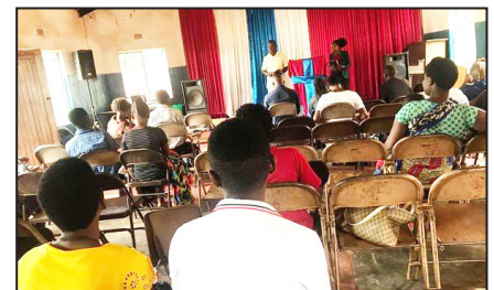
Men sitting with their wives in a church service