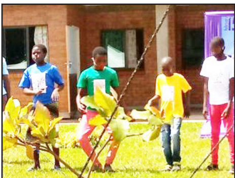
Cancer survivors dancing to some music during World Child Cancer Day