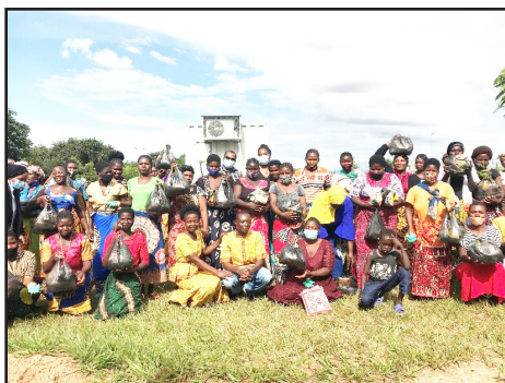
Aid distribution at the hospital. The people are holding gift bags we brought for them.