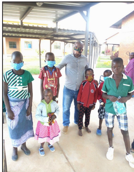
Distributing face masks and food aid to the cancer patients at the hospital