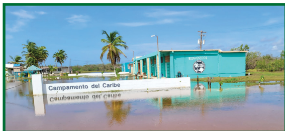
Camp Caribe under water

Traveling to Zambia , GMI team members Bill Vinton and Givemore Nyakambiri conducted a two-week training in October for 15 Bible teachers from the countries of Malawi, Zimbabwe and Zambia as part of the International Teacher's Training program. Many of these teachers have