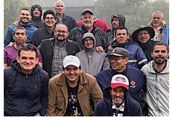
Men of IBG

God's Grace with others for salvation and for building up our brothers and sisters in Christ. It has been a long while since we have had such a team of men dedicated and serving the Lord. There is no doubt in our minds that the devil's workers will be trying to destroy this team (and has already tried). We will begin teaching classes in our Bible institute and have planned events for our family to reach out to others and bring them to activities to hear the gospel presented.