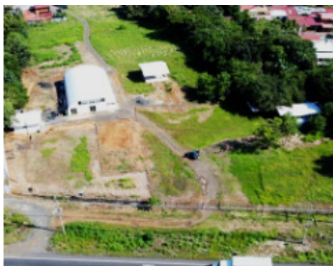
IBG church and land

As a church (Iglesia Biblica de la Gracia) we bought a piece of land nearly 4 years ago. It was a work of God that we had prayed about, and He answered! We were amazed (How can we be surprised by God?). Now these years later