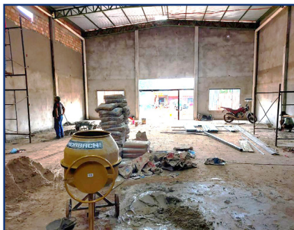
Paraguay church—before the remodeling project