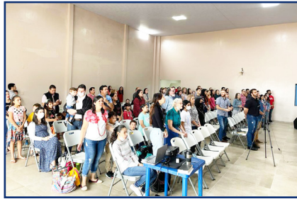
Paraguay church—after the remodeling project