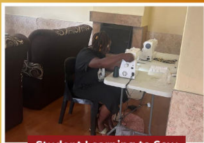
Student Learning to Sew