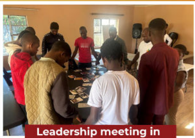
Leadership meeting in Mazini, Eswatini