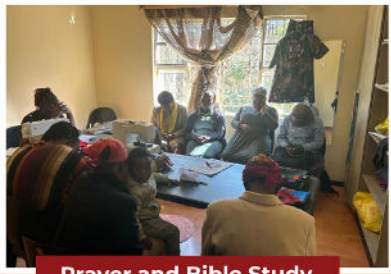
Prayer and Bible Study