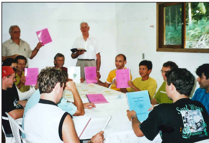
Using the books in Brazil

“A spoken word can drift to irrelevance, A written word can bless with permanence.”