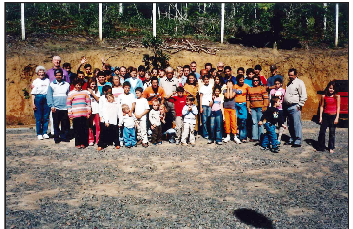
Afterglow—speaking at a conference in Santa Catarina, South Brazil