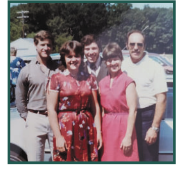
In the early days, airplanes were the best way to transport our family