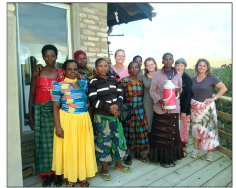
Ladies' Prayer Group

Laselle College from Boston came again—this time with 16 students and two instructors—so there was a lot to do at the campus to get everything ready, but their excitement made it all worth it. They worked in a local school and paid to hook up the electric line to the headmaster's office so he can run the copy machine they bought for the school!