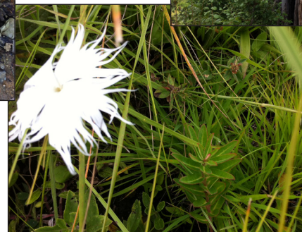
A wild carnation