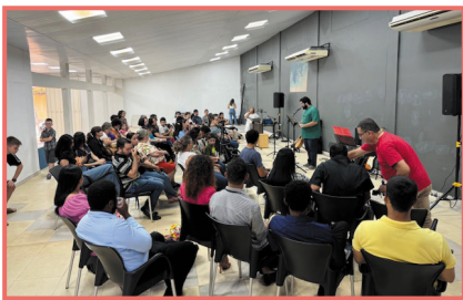
New building in Paraguay

• In Paraguay , Iglesia Bíblica Bereana (Berean Bible Church) in the Ciudad del Este metropolitan area is meeting in a new location. In recent weeks and months, the church has experienced exciting growth which encouraged them to look for a new building to rent. February 4 was their first Sunday in their new location, just down the street from where they had been meeting, with around 70 people in attendance! Pray for the GMI team working with this church plant as they continue to identify and equip leaders to shepherd this church and other new congregations in the region.