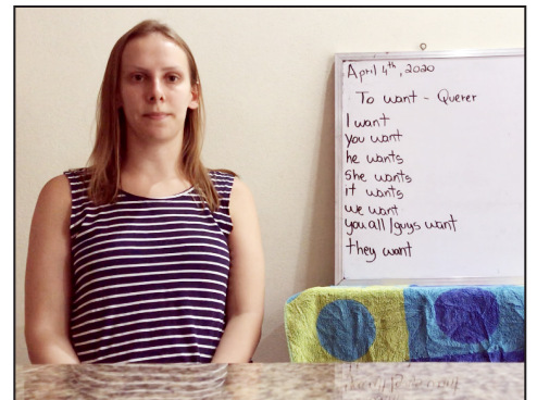
English class via video