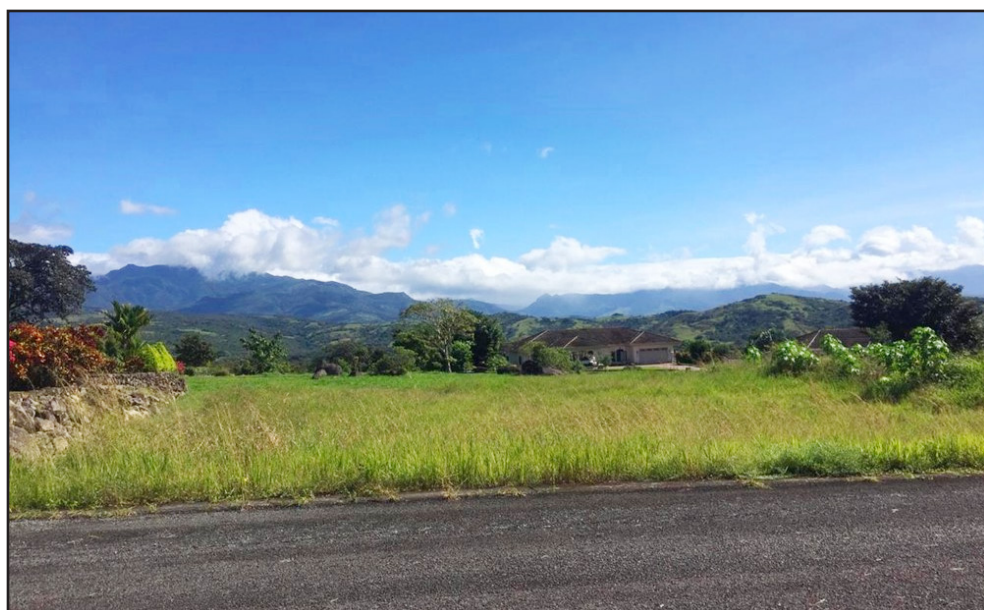
Another view of land in Panama