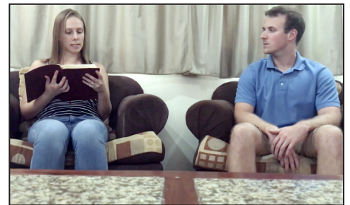
Video Bible study

The ministry at the Arraigados church in Nagarote has been really great to be participate in. In January, we started an English class for people in Nagarote. Many of the people have the desire to learn English. This ministry has allowed us to provide a service for free to people who normally would not have the chance to learn English. This ministry also gave us another opportunity to practice our Spanish. When the coronavirus began to spread, much of the world was brought to a screeching halt. Because Nicaragua is a very poor country it remained unrestricted so that business could continue. Although Nicaragua wasn't restricted, we decided to stop having the ministries (in person) to help protect the people. All ministries were continued through