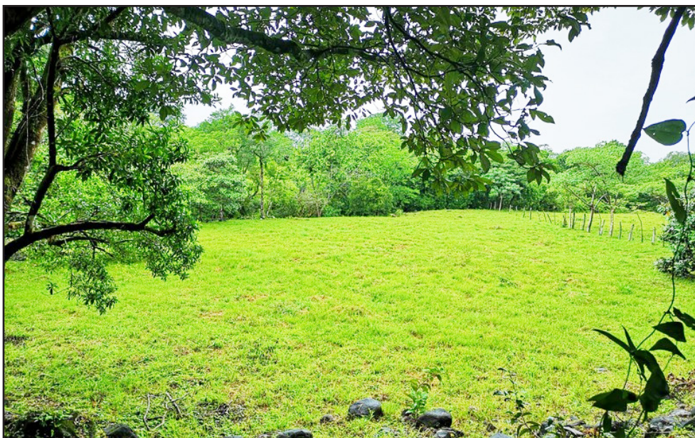
A piece of land in Panama