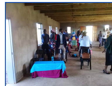
New church plant in Eswatini