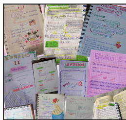
Devotional studies Patty was doing