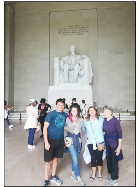
On our trip to PA