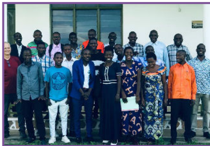
Burundi Grace Bible Institute

• In Burundi , the last week of November, Burundi Grace Bible Institute offered its first Bible-school module. Nineteen men and three women took two courses ("Salvation" and "Bible Study Methods") taught by the GMI team in Burundi. These are the first of ten required courses for students to complete their first level of training. Members of ten local churches from seven denominations took part in the program. The biblical material was eye-opening for the attendees. One church leader shared, "Wow, I was preaching mistakes, now I need to go back and teach this correctly." Another confessed, "I have to ask God for forgiveness. God please forgive me. I was a liar. I was not preaching the true gospel."