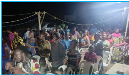
Bible Seminar Attendees