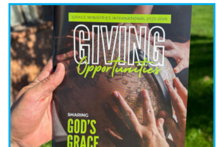
The 2025 Christmas Catalog

• Christmas Projects. Thanks so much for your generosity. As of the week of Christmas, giving had outpaced previous years! There are over 63 projects submitted by GMI's team members around the globe designed to change lives and impact the world for Jesus Christ. To view the projects online, visit gracem.org , click on the "Projects" tab and then the tag, "2025 Christmas Catalog."