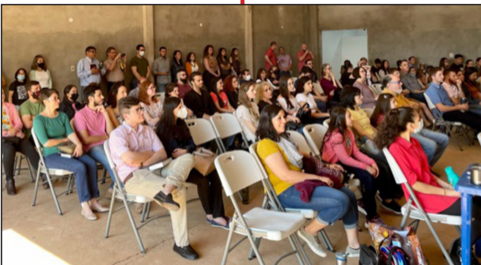
Worship at Iglesia Biblica Gracia, soon the sanctuary will be finished!