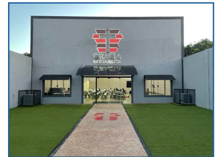
The finished exterior of the church