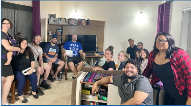
English Bible study in our home