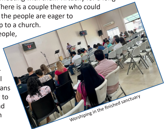
Worshipping in the finished sanctuary