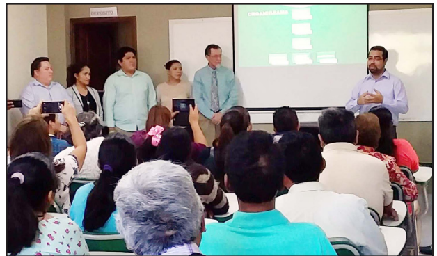
The board of Centro Bíblico de la Gracia at the dedication service