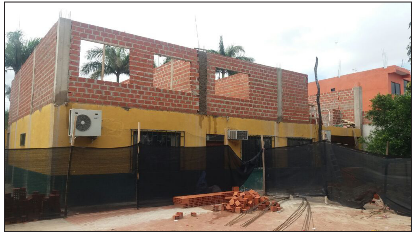
The construction of the Training Center should be complete by the end of the year