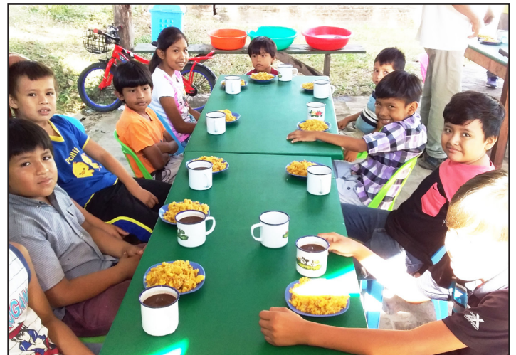
Children at Ebenezer Church enjoy breakfast each week before Sunday School

The third project, a Pro-Life presentation to high school students, is on hold until after schools reopen.