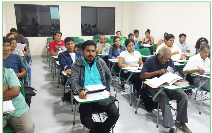
Students in the Centro Bíblico de la Gracia will be ready to resume class once the quarantine is lifted

Our current plan is to complete two trimesters this year. The possibility of a third will depend upon when the restrictions are lifted for on-site education. We are asking the Lord for wisdom as we move forward.