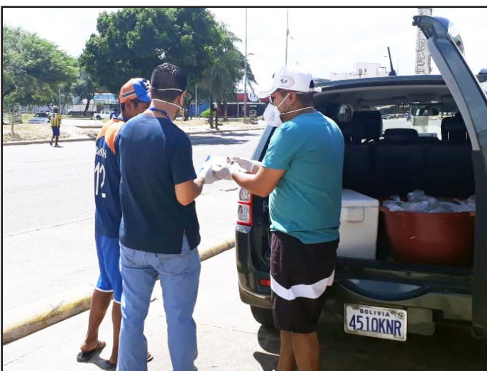
DAR ministry delivering meals and the gospel to the homeless