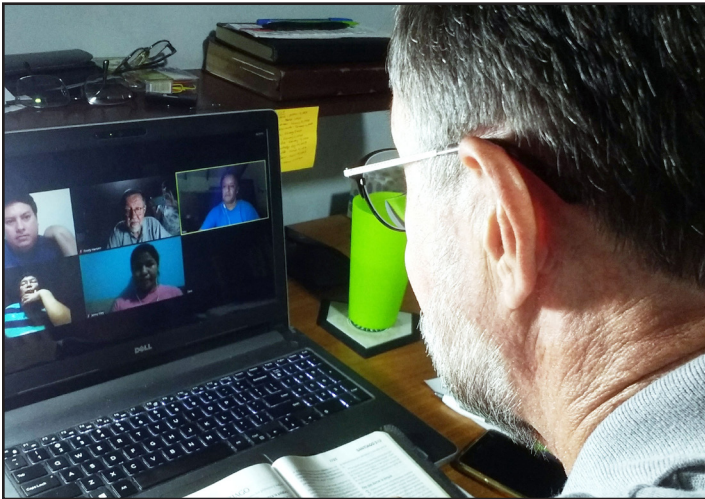
Frosty joined MEB leadership to discuss the physical and spiritual needs of our churches