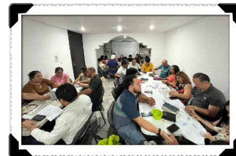
Friday night Bible class in Mérida, Mexico