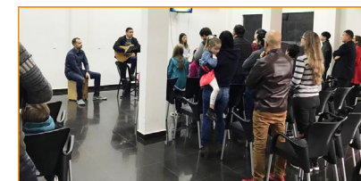
New church plant in Ciudad del Este