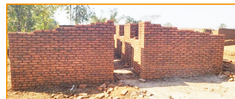
Pig barns under construction

churches; youth ready to do another one soon and add more days so they can learn more; and even young, married couples who attended and have gone home and put into practice some of the things they learned in the Bible teaching times and the breakout groups for married youth." Meanwhile, the Nyakambiris, also serving with GMI in Malawi, report that the pig building is almost complete in Mbewa as part of a project to enhance the livelihood of women in the area.